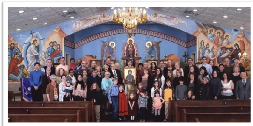
Church Family, Feast of St. Philothea, 2020